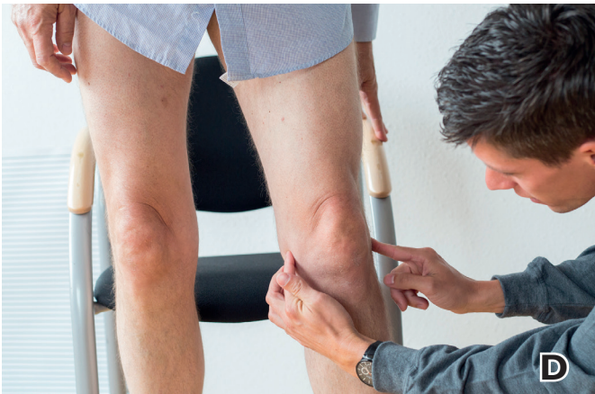
D. Determine the anatomical knee axis