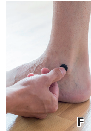
F. Mark the lateral malleolus of the ankle. (Only for UTX)