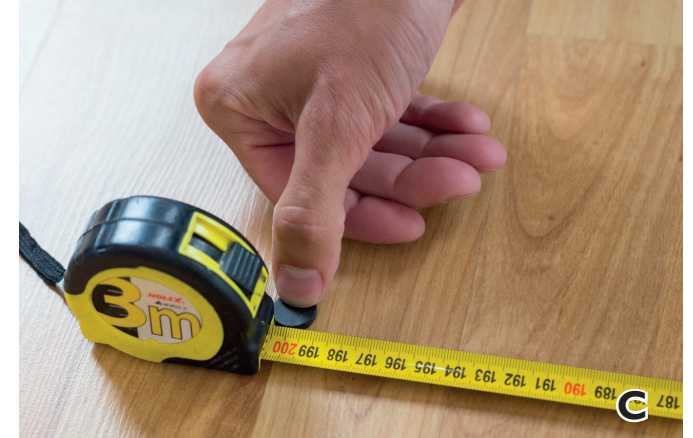
C. Mark the floor at 2m (80 inch) distance from the wall.