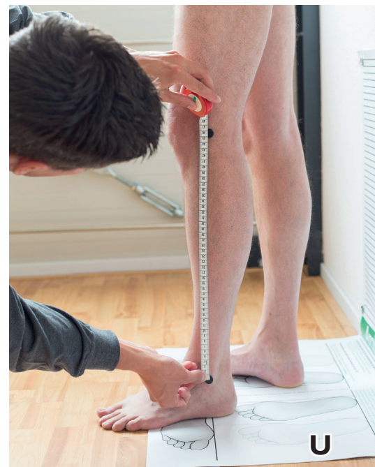
U. Measure distance lateral malleolus till knee axis.