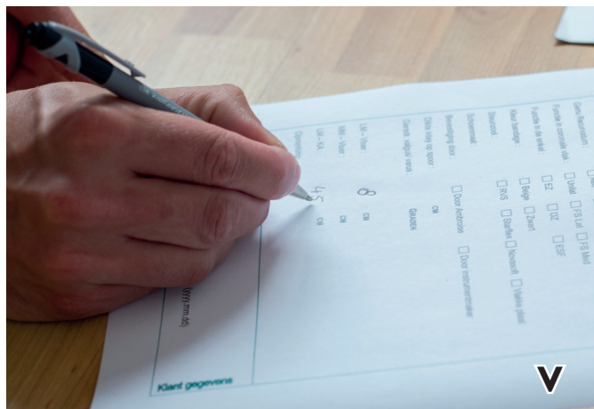
V. Write the measurements on the measurement form.

Send the form to genuxorder@ambroise.nl or utxorder@ambroise.nl .