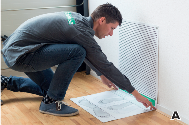
A. Fold the poster on the black line and attach it to the wall.