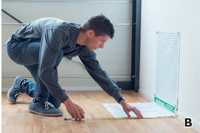
B. Measure 2m distance (80 inch) from the wall.