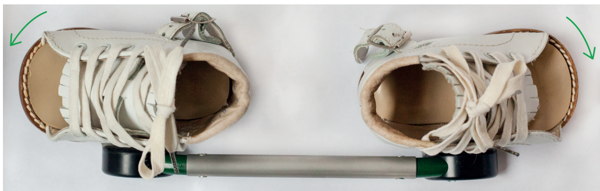
Figure 3: The DYNCO, top view

Order the consecutive DYNCO size about 2 weeks in advance when required.