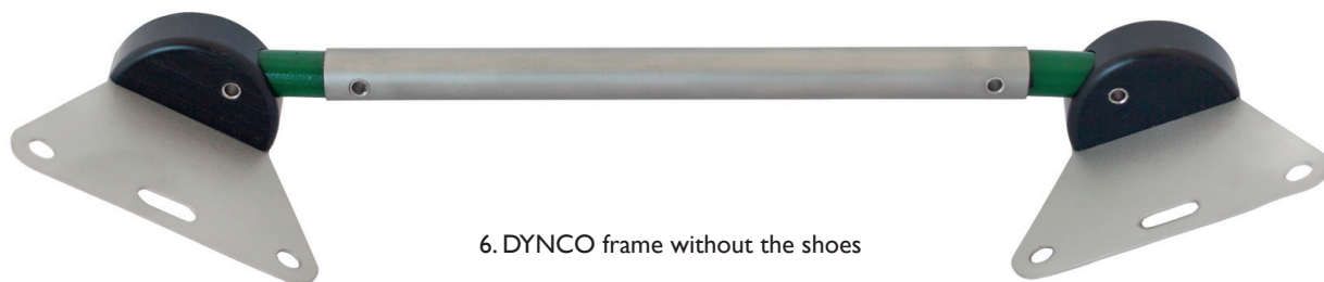
6. DYNCO frame without the shoes