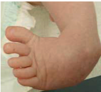
Figure 1: A Clubfoot

The DYNCO is designed for children with a congenital clubfoot. Characteristic for the clubfoot is that the foot is turned inside or is tilted down in the shape of a golf club. As shown below.