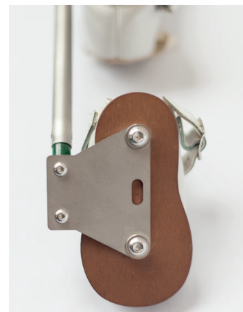
Figure 5: Mounted shoe to the foot plate.