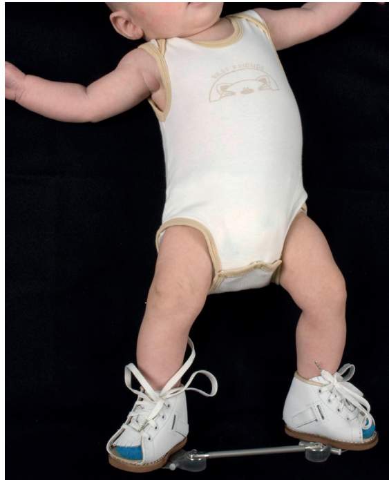
Figure 2: The DYNCO

Also as a night splint the DYNCO is a lot more comfortable. Due to the large freedom of movement of the DYNCO, blanket battles are history.