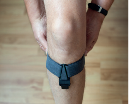
Figure 2: Donning the calf strap