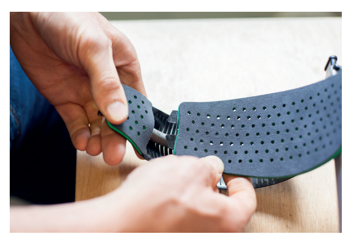
3. Remove the yellow strip, and press the flaps of the inner shell trough the first groove of the outer shell.