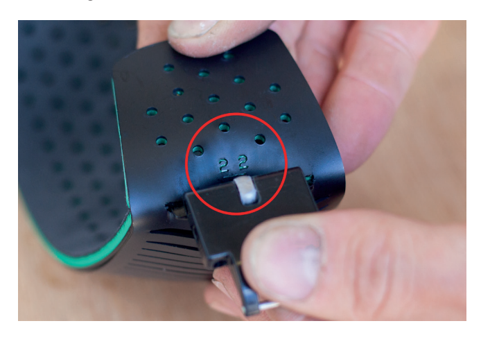
6. You can find the size of the shell on the inside of the outer shell.