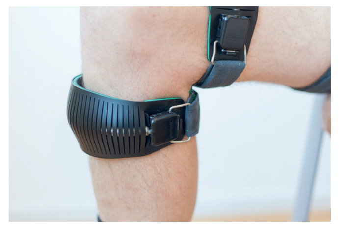
4. When you hear the 'click' it means the clip is closed correctly.