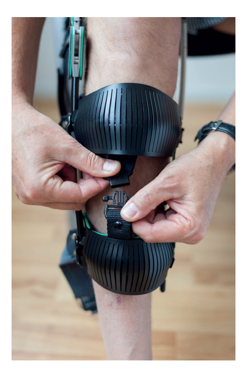
Figure 3: Connecting the Genux to the calf strap

The clip that attaches the Genux to the calf strap is easy to loosen by pressing the two pins