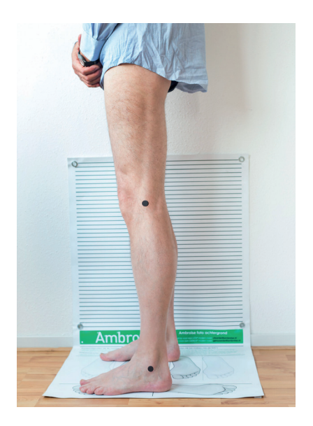
Figure 4: Photo measurement, casting the leg is no longer needed.

If you're interested in additional information on the Genux or if you want to find out if the Genux could benefit you, please feel free to contact us. You can phone us at +31 53 430 28 36 or email us: info@ambroise.nl. One of our clinical experts is more than happy to discuss the best solution for your problems with you. And we're more than happy to see how we can realise a well fitted Genux for you, provided that this will be a suitable option in your case. Your local orthotist or specialist should also be able to provide additional information on the applicability of the Genux in your case.