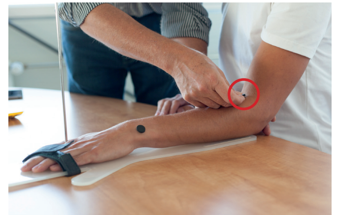
F. Finally mark the elbow pit.