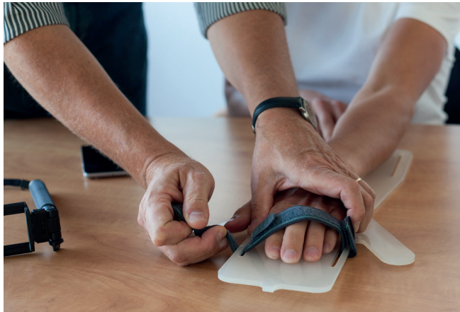
B. Place the hand on the size board. The Velcro straps keeping the hand in its place.