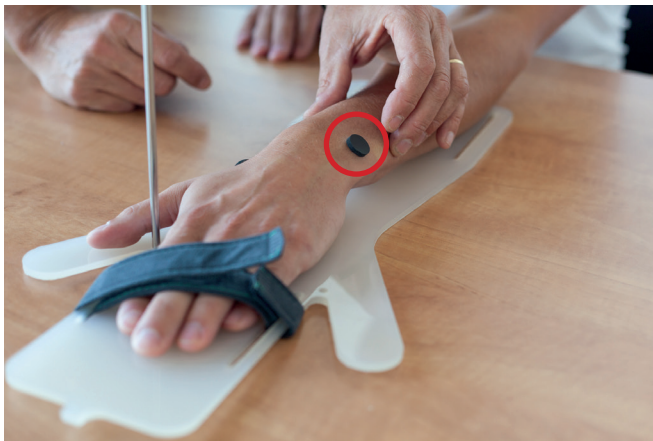
E. Place a marker at the ulna styloid process on the wrist.