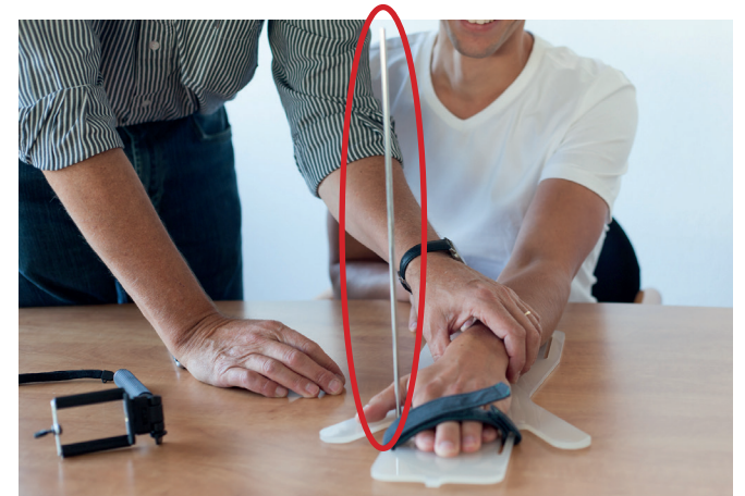
C. Place the pin on the thumb side of the hand.